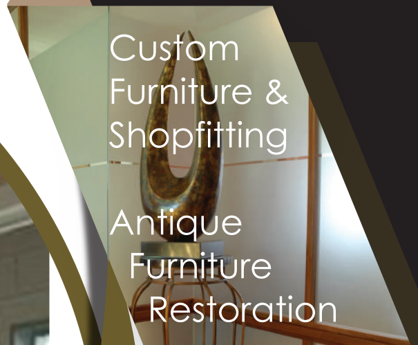
Custom Furniture & Shopfitting