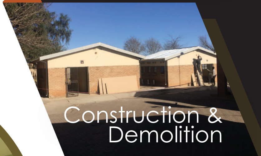
Construction & Demolition